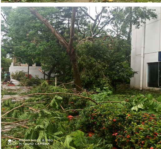
Amphan effect at Brainware Campus, Barasat